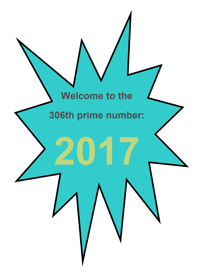
A prime number is a number which only has two factors, itself and 1.