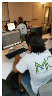
Forsyth MATH 0090 B & Q students celebrated Pi Day with a different type of round dessert!