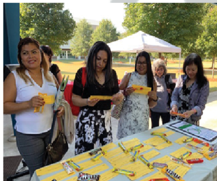
(Photos taken earlier this month for Student Appreciation Day at the Dawson and Forsyth campus.)