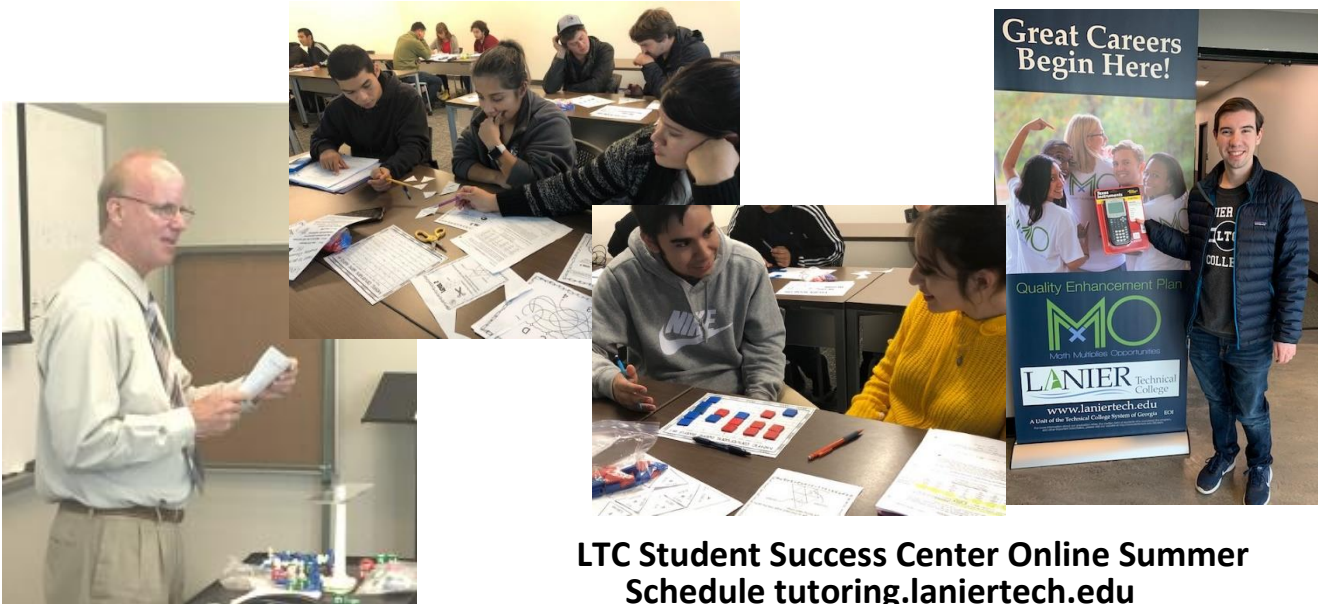
LTC Student Success Center Online Summer Schedule tutoring.laniertech.edu

Lanier Technical College wants its students to be successful; so, we continue to improve in every way we can. We offer Boot Camps, Workshop Wednesdays, and extended tutoring hours. We want to support our students and to help them achieve their dreams.