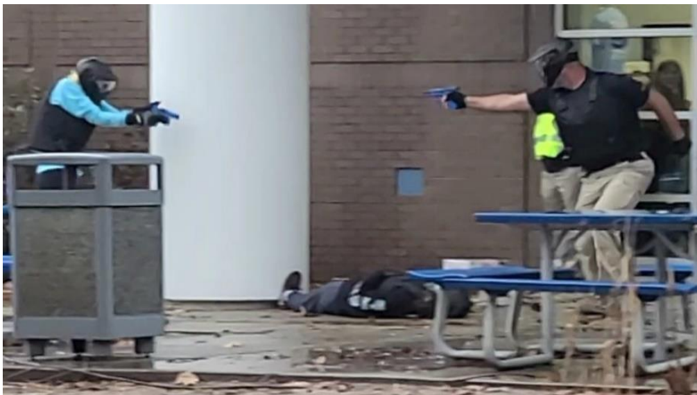
Photo of Active Shooter Exercise and Training January 3, 2023

Campus Police have received training in Incident Command and Responding to Critical Incidents on Campus. When a serious incident occurs that causes an immediate threat to the campus, the first responders to the scene are usually Campus Police, local law enforcement agencies, local fire responders and emergency medical services. All departments typically respond and work together to manage the incident. Depending on the nature of the incident, other College departments and local or federal agencies could also be involved in responding to the incident. General information about the emergency response and evacuation procedures for Lanier Technical College are publicized each year as part of the institution’s Clery Act compliance efforts (LTC’s Annual Security Report). That information is available on the Lanier Technical College website at www.laniertech.edu .